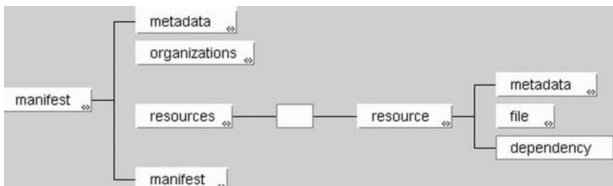
Figure 3.4 <resources> elements.

Description. This element identifies a collection of physical content files.