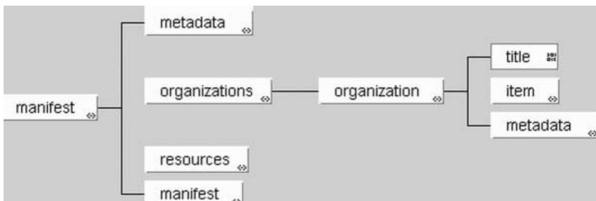
Figure 3.3 <organizations> elements.

Multiplicity. Occurs zero, once, or more within a <manifest> element.